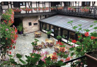
Le Gouverneur Hotel