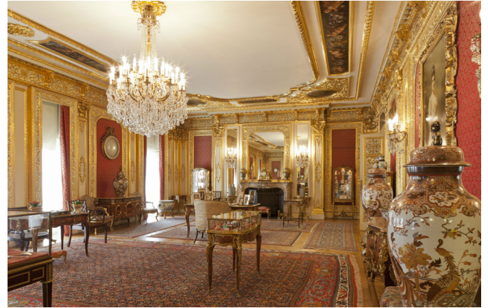
Gold Saloon, Polesden Lacey

Where science and nature collide, Kew - a UNESCO World Heritage Site - is home to over 50,000 living plant species, including rare and threatened plants housed in the world's largest Victorian glasshouse. Kew plays host to many events throughout the year, from wellness and forest bathing to music and art sessions, but surely one of the most spectacular is 'Christmas at Kew'. This unmissable treat heralds the start of Christmas every year and has become one of the UK's most acclaimed illuminated trails. The gardens and Temperate