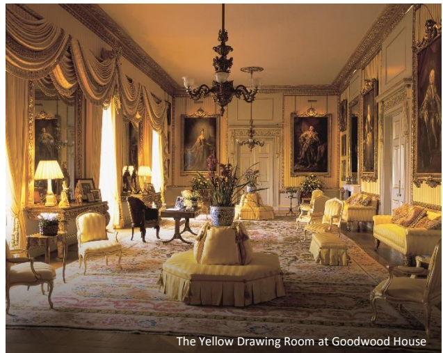
The Yellow Drawing Room at Goodwood House

We will arrive at Goodwood House around 10.15am and have coffee/tea and biscuits in the Front Hall. This will be followed by a guided tour of the state apartments at 11am. We look forward to gaining an insight into the fascinating history and heritage of Goodwood.