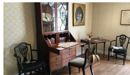
Drawing Room