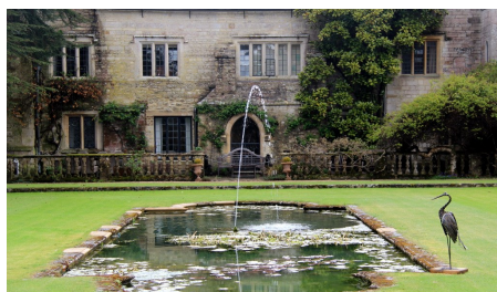
Athelhampton