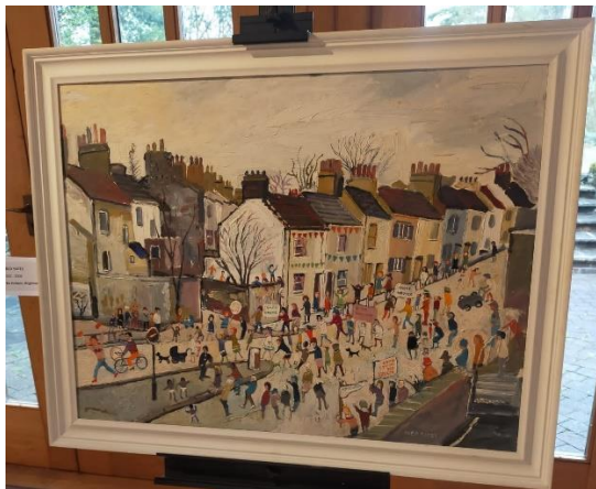
View of Brighton

Just a flavour of the paintings and sculptures on view: