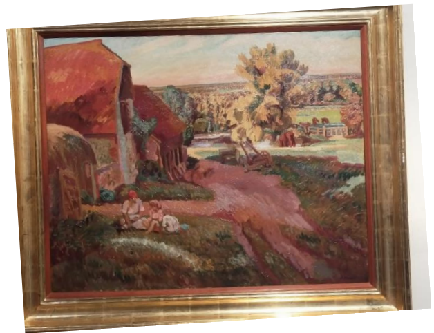
Duncan Grant – The Barn at Charleston