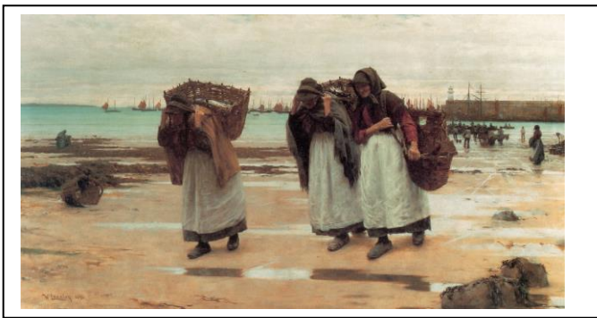
The Breadwinners (Newlyn Fishwives), by Walter Langley (1852-1922)

Champs Hill, Waltham Park Road, Coldwaltham, Pulborough, West Sussex, RH20 1LY