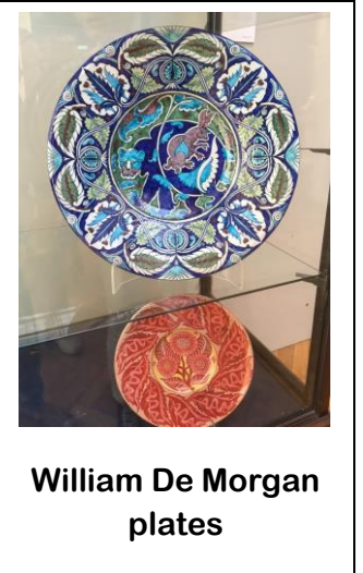
William De Morgan plates