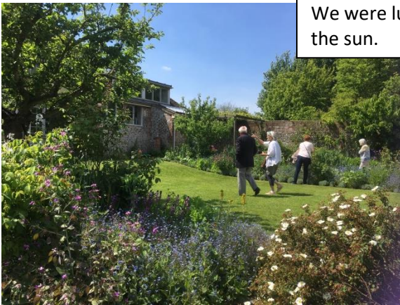
We were lucky with the sun.