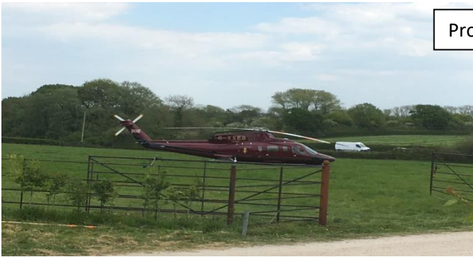
Proof she was there!

This was definitely the highlight of our day.